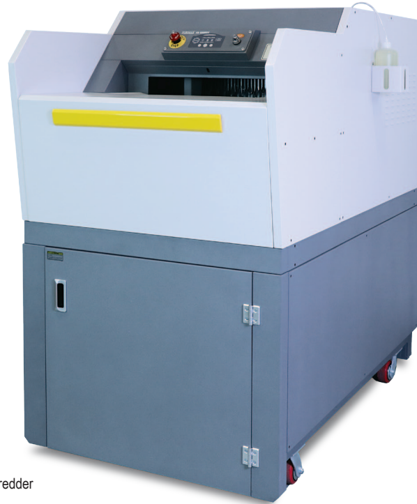
FD 8906CC Industrial Shredder