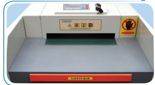
Large infeed deck with conveyor belt feed and safety bar for immediate shut down

Keeping the FD 8804SC in top condition is easy to do. With the Auto Cleaning function, clearing the blades of shredding debris is as simple as pressing Reverse on the control panel. Plus, the EvenFlow™ Automatic Oiling System lubricates the all-steel cutting blades, helping to keep the shredder in peak condition for optimal efficiency.