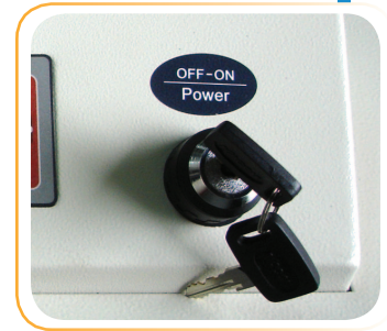
Keyed On/Off switch

The FD 8804SC offers unmatched automated features through its LED control panel. The easy-to-read Load Indicator assists operators in determining how close they are to the maximum shred capacity to avoid jams and provide optimal efficiency. Indicators also notify operators when the waste bin is full or the cabinet door is open. Operators can select from two modes of operation: Auto Start/Stop or Manual. Auto Start/Stop mode utilizes optical sensors which detect paper and start/stop operation automatically. Manual mode provides non-stop operation for shredding small sized paper or films.