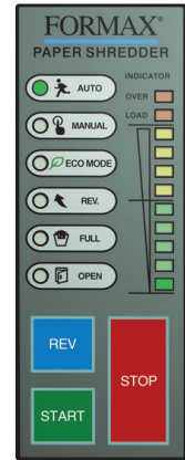
Easy-to-use control panel with Load Indicator and ECO Mode