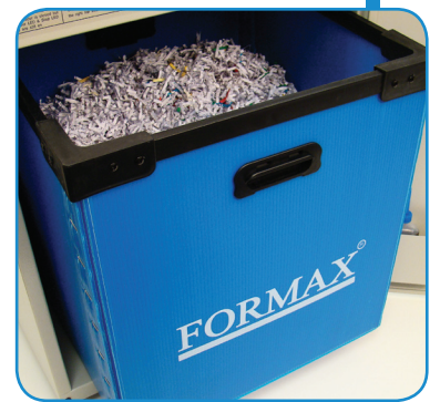
Lifetime Guaranteed Heavy-Duty Waste Bin