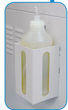
Optional EvenFlow™ Automatic Oiling System

Formax – New Hampshire, USA www.formax.com