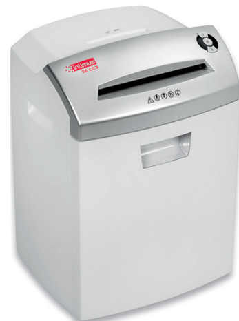
intimus 32 W/D/H 39 x 36 x 60 cm