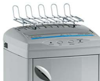
Computer forms top shelf to save office space (Space Saving Design)