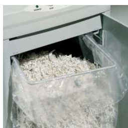
Front door for easy emptying of collecting bag