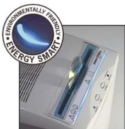
"ENERGY SMART" Management system for power saving stand-by mode