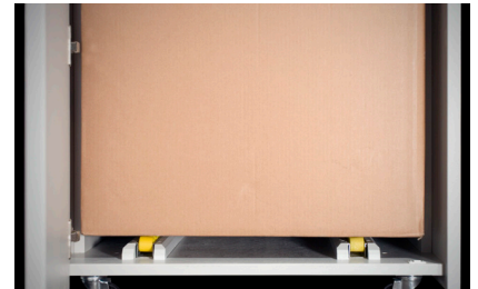
Conveyor of rollers on each side allows for easy removal of the 50 gallon waste container.