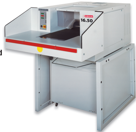
W/D/H 120 x 195 x 155 cm

For decades, the intimus® heavy duty shredders have proven to be centrally positioned pieces of equipment for the privacy-friendly disposal of disused media. The model range offers variations that can handle up to 550 sheets/h or even complete folders in a single operation. The spacious feed table with integrated infeed conveyor belt provides controlled, effortless, safe and fast loading. The shredded material is collected in large-scale, mobile or swing-out containers under the cutting mechanism. The shred-press combinations are coupled to a baler for immediate fully automatic compaction of the cut material into compact bales. Reduction effect compared to the loose collection of the cuttings is about 70%.