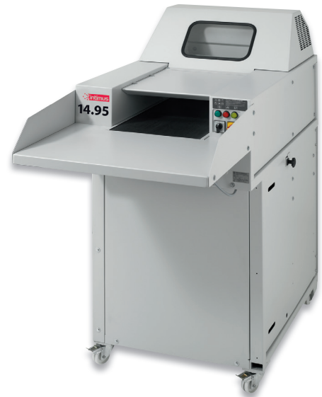
W/D/H 80/120 x 167 x 163 cm

For decades, the intimus® heavy duty shredders have proven to be centrally positioned pieces of equipment for the privacy-friendly disposal of disused media. The model range offers variations that can handle up to 550 sheets/h or even complete folders in a single operation. The spacious feed table with integrated infeed conveyor belt provides controlled, effortless, safe and fast loading. The shredded material is collected in large-scale, mobile or swing-out containers under the cutting mechanism. The shred-press combinations are coupled to a baler for immediate fully automatic compaction of the cut material into compact bales. Reduction effect compared to the loose collection of the cuttings is about 70%.