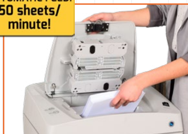
Up to 400 sheets paper tray for auto-feed system: 50 sheets per minute shredding speed