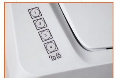
(Option) 4 Digit Electronic Combination Lock