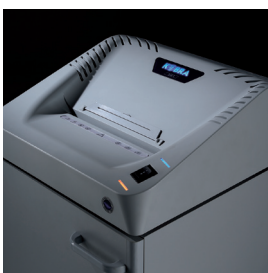
LED INDICATORS Easy to operate ON OFF Reverse switch, with LED signal for bag full or open door