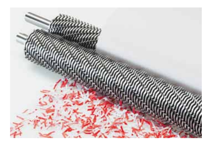
SOLID STEEL CUTTING SHAFTS Robust and durable: high-quality paper clip proof cutting shafts from special hardened steel. 30 years guarantee on the cutting shafts.