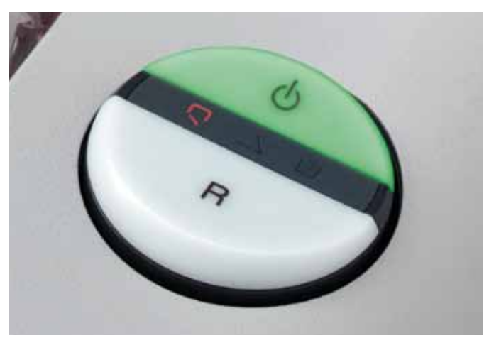
EASY_SWITCH Ease of operation: intelligent multifunction switch element with integrated optical signals indicating the operational status. Additional "emergency switch" function.