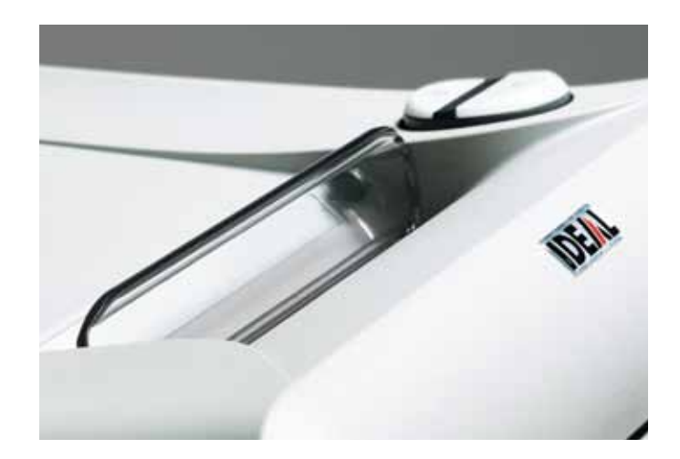
SAFETY FLAP Extremely safe: electronically controlled safety flap in the feed opening to keep fingers, ties or other objects away from the cutting shafts.