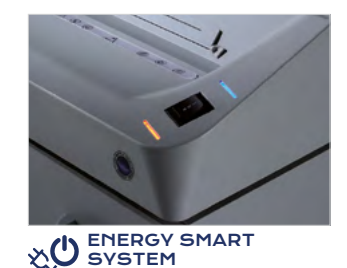
Illuminated indicators for power saving in stand-by mode. Easy to operate On/Off/Reverse switch, with LED signal for bag full and/or open door.

Motor thermal protection. Continuous duty motor, no overheating and no duty cycles. Integrated flap for CDs, DVDs, floppy-disks and credit cards shredding.