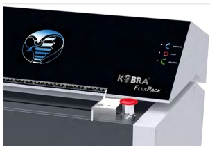
REMARKABLE TOUCH SCREEN PANEL