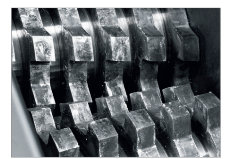
Solid steel cutting rollers

The selection of the correct functional mode will always ensure maximum throughput for the respective material type.