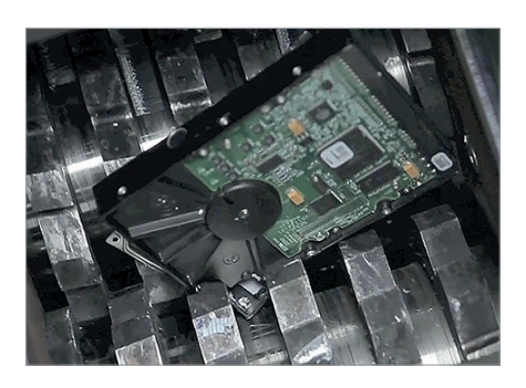
Material anti-jam function

Data media can be shredded easily in decentralised locations with this machine.