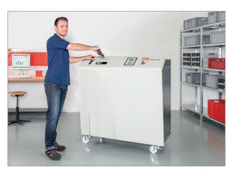
For decentralised destruction

The large and clearly visible LED display enables the continuous input of media at a comfortable working height.