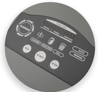
LED keypad with easy-to-use controls for simple operation.