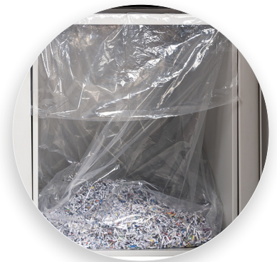
High capacity shredder can hold up to 68 gallons of waste in roll-out bin.

The PowerTEC® 909 HS Hopper Shredder is a high capacity machine for destroying sensitive information on paper and optical media. It features a powerful chain driven motor, an automatic EvenFlow Lubricator, and simple push button operation. This shredder is rated for Security Level P-3 destruction and holds up to 68 gallons of waste. It's precision engineered and guaranteed to provide many years of trouble-free operation.