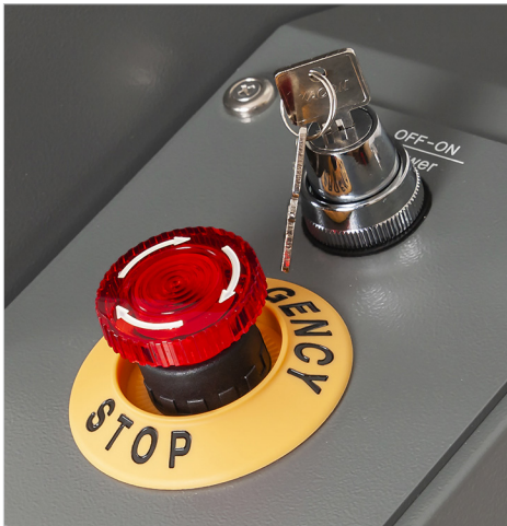
Safety features include emergency stop button and key lock to prevent unauthorized use.

The PowerTEC® 909 Hopper Shredder has multiple feed openings to conveniently shred high volumes of paper and optical media.