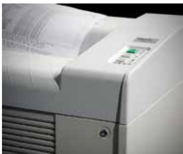
Dahle High Security shredders have been tested and approved by the NSA under NSA/CSS Specification 02-01.

In order to protect our National Security, military and government agencies require higher levels of security from their paper shredders. With this in mind, the U.S. Department of Defense has increased the requirements for the destruction of Top Secret COMSEC documents. NSA/CSS Specification 02-01 is the current standard for maximum particle area and maximum particle dimensions as well as setting a tough standard for machine durability.