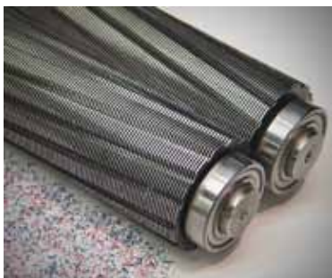
Dahle High Security cutting cylinders reduce a sheet of paper to over 15,500 pieces.