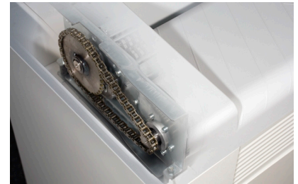
Chain-driven cutting mechanism provides slip free power for maximum throughput.