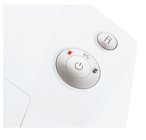
The full bin is indicated via the display and the machine switches off automatically.