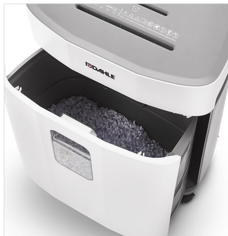
The 7 gallon waste bin features a clear window to view shred level and is easy to empty.