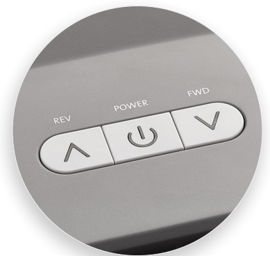
Convenient, easy-to-use controls for simple operation.