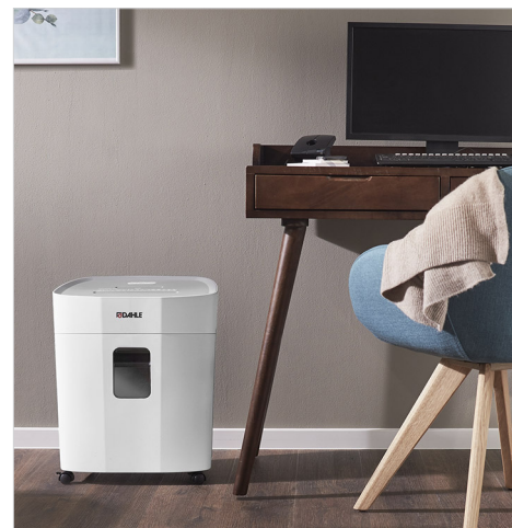
Compact size makes it easy to place the shredder wherever you need it most.