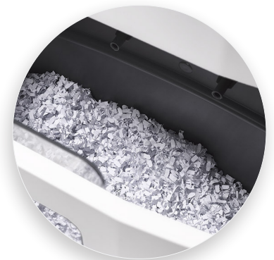
Security Level P-4 for the destruction of confidential documents.